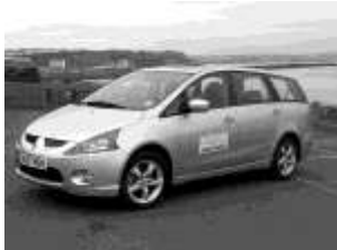
6 seat people carriers